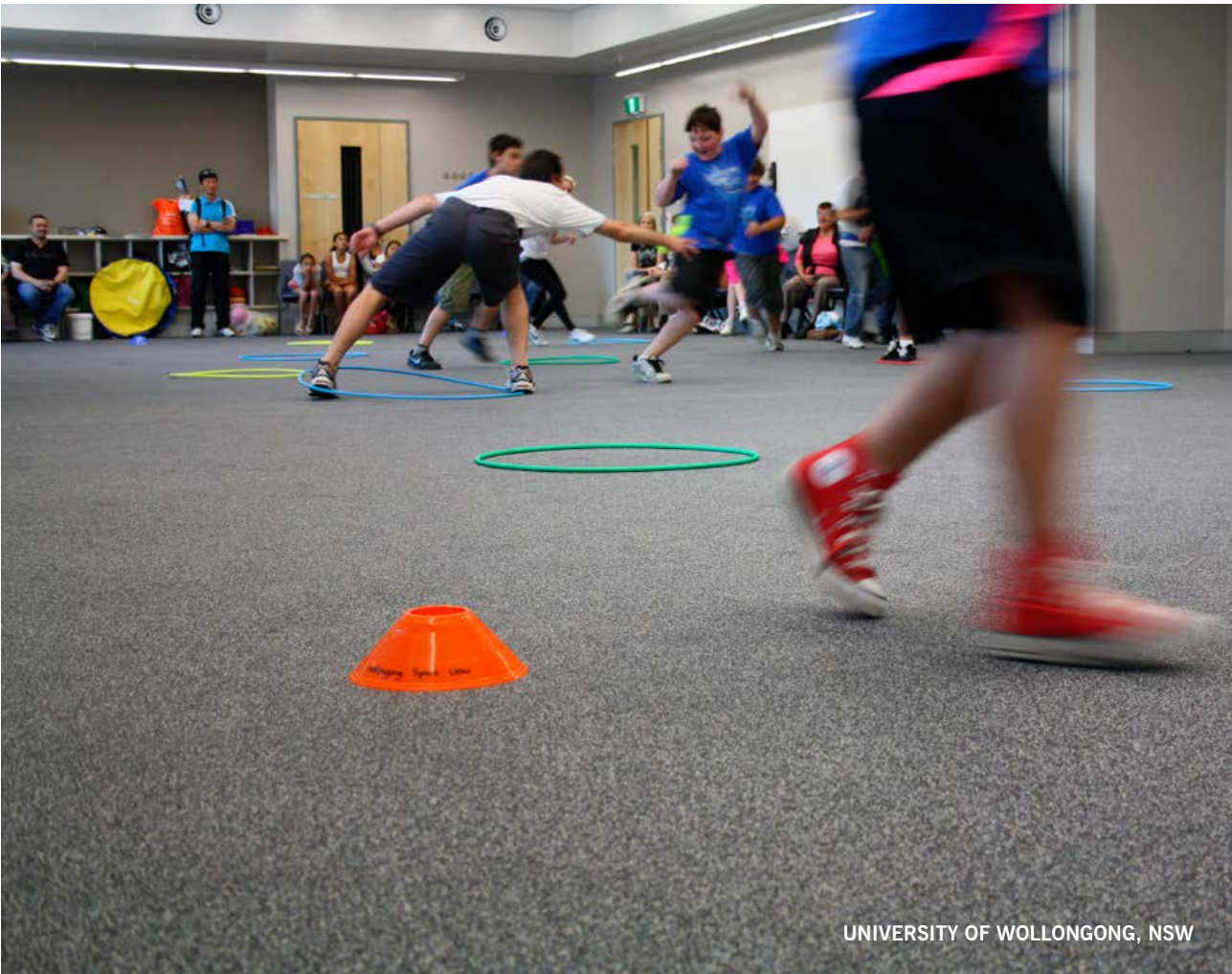
UNIVERSITY OF WOLLONGONG, NSW