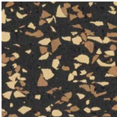
Vitality Kush 4