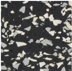
Vitality Berlin 4